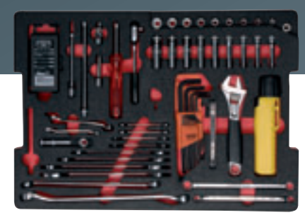
Aviation Tool Box: Tray 1